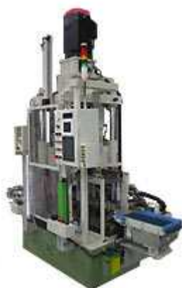
20 tons (200 Kilo Newton) Electrical Screw press machine