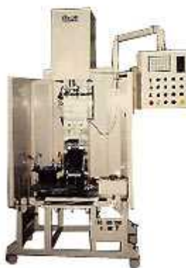
2 tons (20 Kilo Newton) Electrical Screw press machine